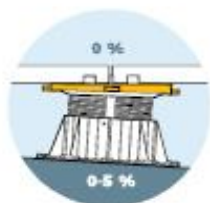
Integrated slope corrector